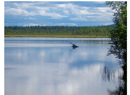
Guided canoe tours