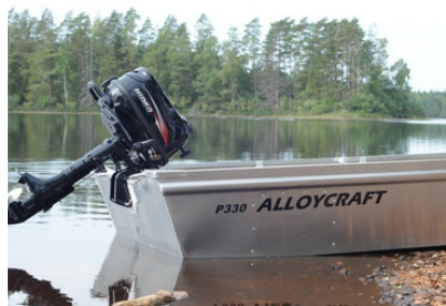
Boats and engines